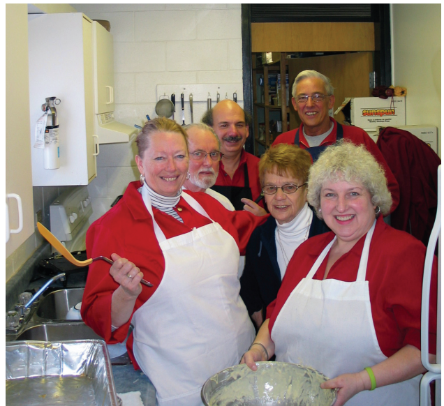
“Cooking Up Change”. Members of Making Kenora Home wield their tools during the Week of Action Against Poverty (Feb. 11-17, 2007). An amazing 6.3% of the community participated in a wide range of events intended to raise the profile of local poverty issues.

The Coalition of Community Health & Resource Centres of Ottawa took this photo of their cooperation with Make Poverty History supporters, including centres advocating the social determinants of health and the end of poverty, plus students and teachers who support social justice for everyone in the province, and indeed, across the country.