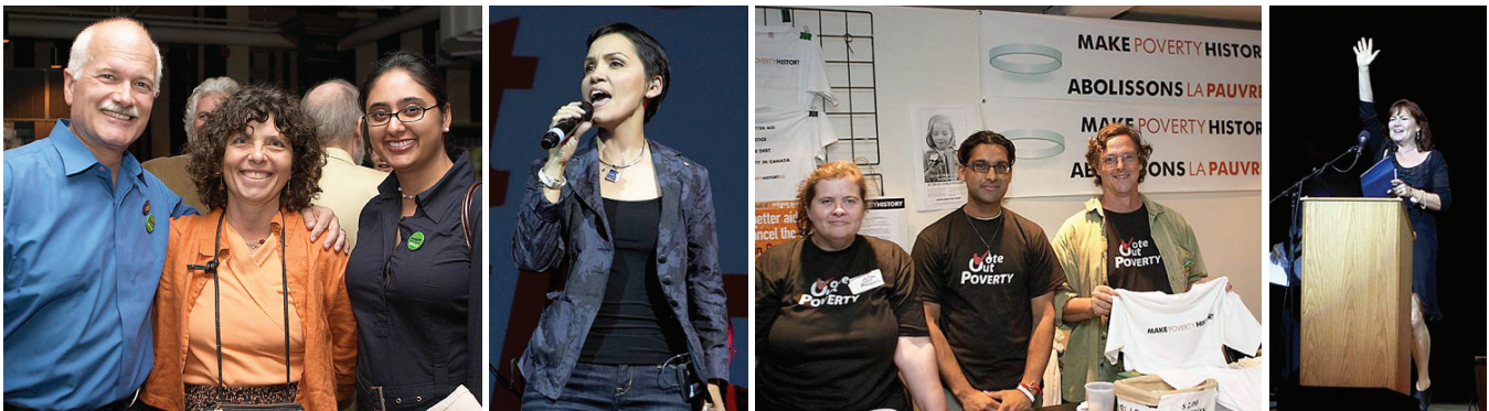
The Vote Out Poverty event was held on October 1st, 2007 at Massey Hall. .....