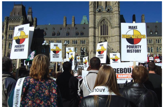
The Coalition of Community Health & Resource Centres of Ottawa with Make Poverty History supporters (photo courtesy of the Coalition of Community Health & Resource Centres of Ottawa).